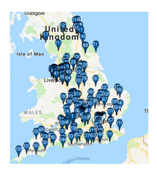
Age of Creativity Festival map of events

Wow. So we are on week two of the festival! I've been blown away by the number of events in our programme this year and the level of engagement we've had on social media. Not only have we connected with events from across the country, but I feel as though I've really got a flavour of the type of work so many of you are doing both in person and online. It's easy to see 'creative pop up shop', 'dementia craft session' or 'dance for Parkinson's' in the brochure and make assumptions, but only when see it for yourself do you really understand. If that's how I feel after a decade of specialising in this work, then it just proves why we need a festival like this to raise the profile of our work and share what we do on a national platform.