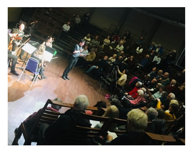
Lunchtime Music Concert, Victoria Gallery and Museum

I want to talk about two specific events that I went to in Liverpool this week. The first was the Lunchtime Music Concert at the Victoria and Albert Museum; an afternoon delight for a packed room of older people on a wet, windy day. What was also interesting is that a number of the musicians performing were also aged 50+, alongside much younger MA students from the University. The fact that 'older people' were part of the cohort of MA students developing their skills as musicians and composers should come as no surprise of course, but it brought my mind back to the conversations we had at the headline conference last week and the assumptions we make as a sector about older artists. Would we call these individuals 'emerging' artists,'re-emerging' artists perhaps- or does it even matter? In many ways, it doesn't; the quality of their performance as a collective was extremely high and that's what we, as an audience, care about irrespective of age. But in terms of them as artists, their career prospects and how they are perceived within the creative industries, I can't help but wonder if it does. Will their life outside the academic institute take a different path because of their age and what is our collective role within our sector to challenge this? I'm keen to explore in more detail with partners soon.